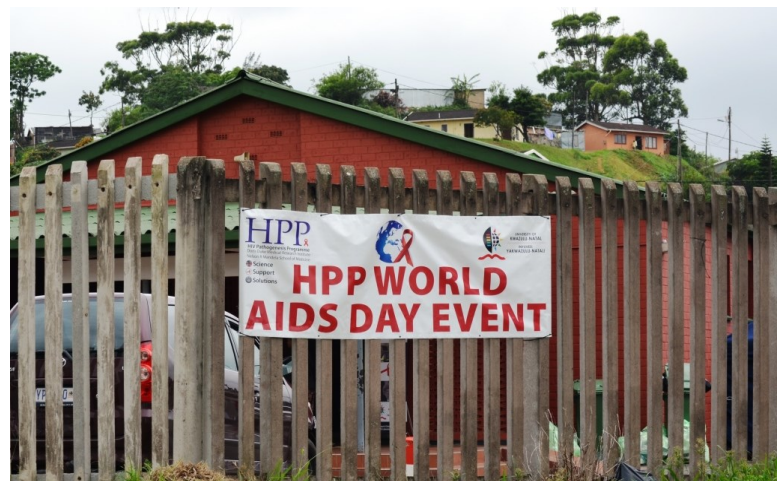
Umlazi D-Section Hall, venue for the HPP WORLD AIDS DAY event.

Umlazi is an area disadvantaged due to historic prejudices and suffers high rates of poverty, violence poor education, and disease. These social factors further fuel the HIV/AIDS epidemic in the area and highlight the need for HIV health promotion initiatives.